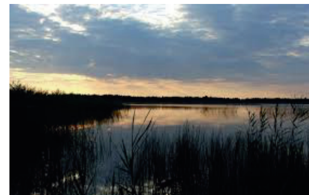
The conference will take place in the Shatsk district of the Volyn region near Lake Svityaz.